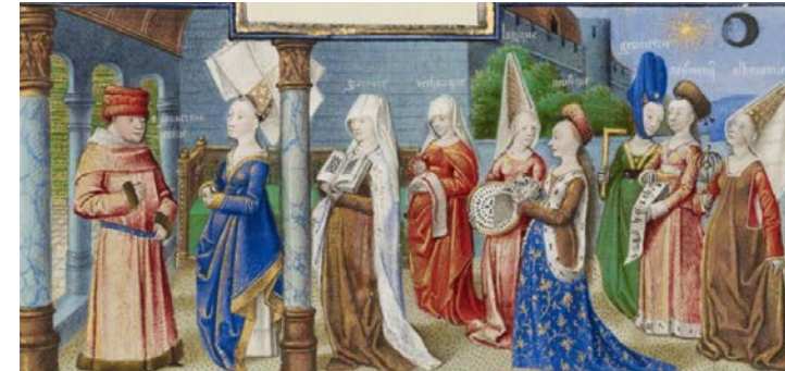
Philosophy Presenting the Seven Liberal Arts to Boethius

“As far as possible, join faith to reason.”